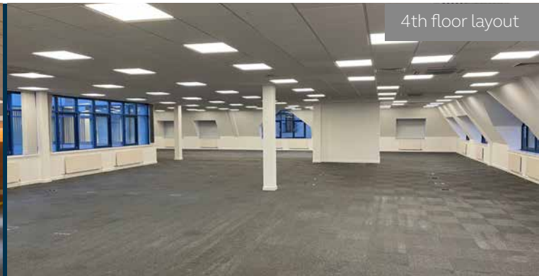
4th floor layout