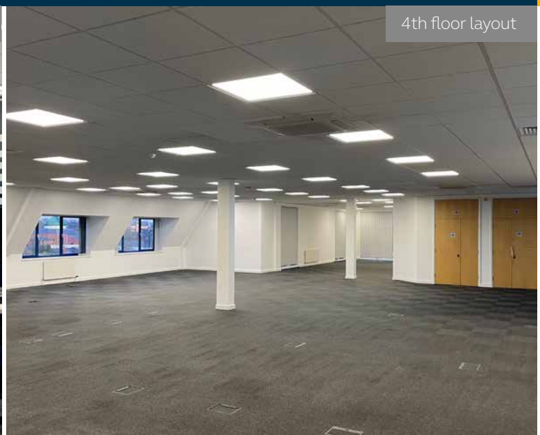
4th floor layout