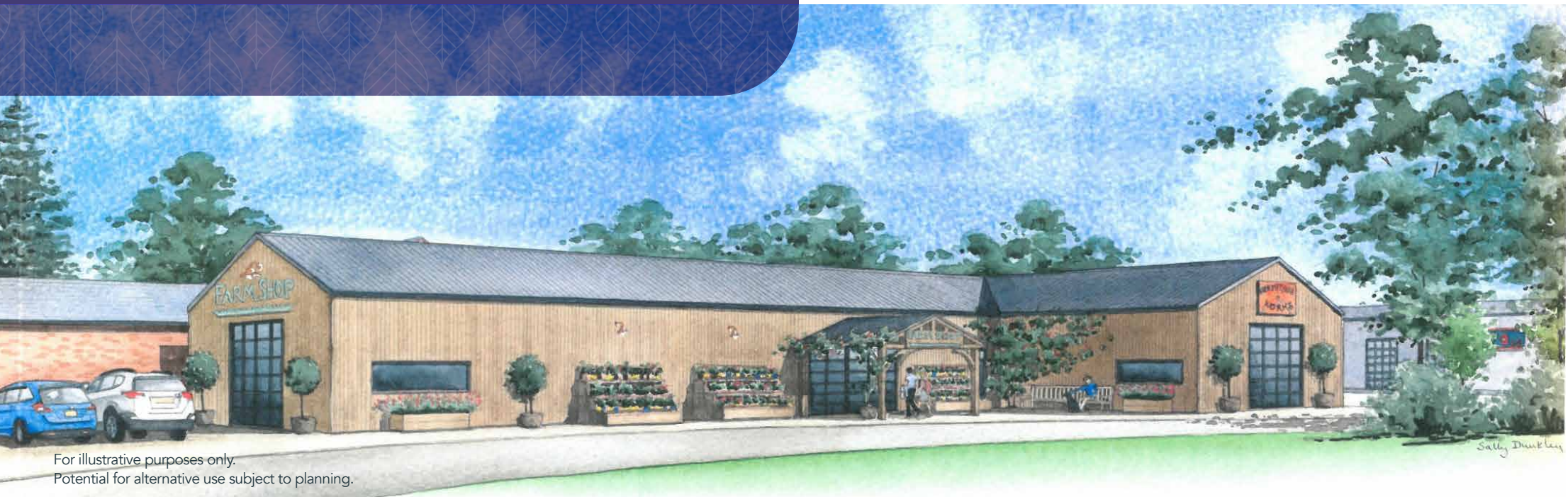
For illustrative purposes only. Potential for alternative use subject to planning.