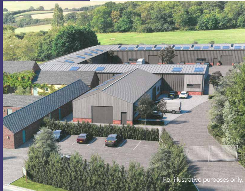
For illustrative purposes only.