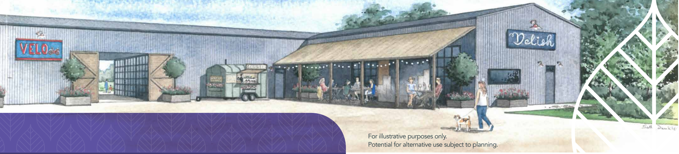
For illustrative purposes only. Potential for alternative use subject to planning.