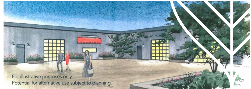
For illustrative purposes only. Potential for alternative use subject to planning.

Unrepresented parties are advised to seek professional advice from an RICS Member or other property professional and read the RICS Code for Leasing Business Premises 2020 together with its supplemental guide.